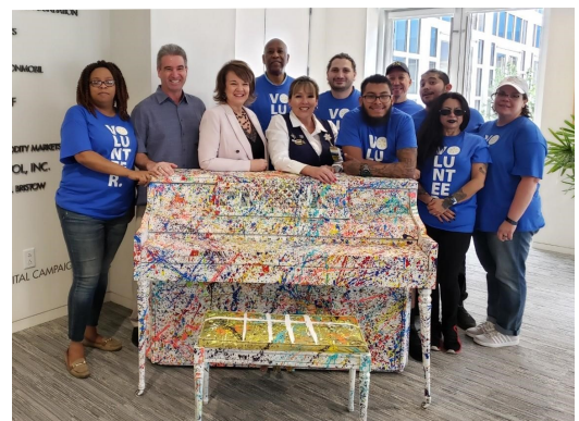
Volunteers from Fulshear Wal-Mart